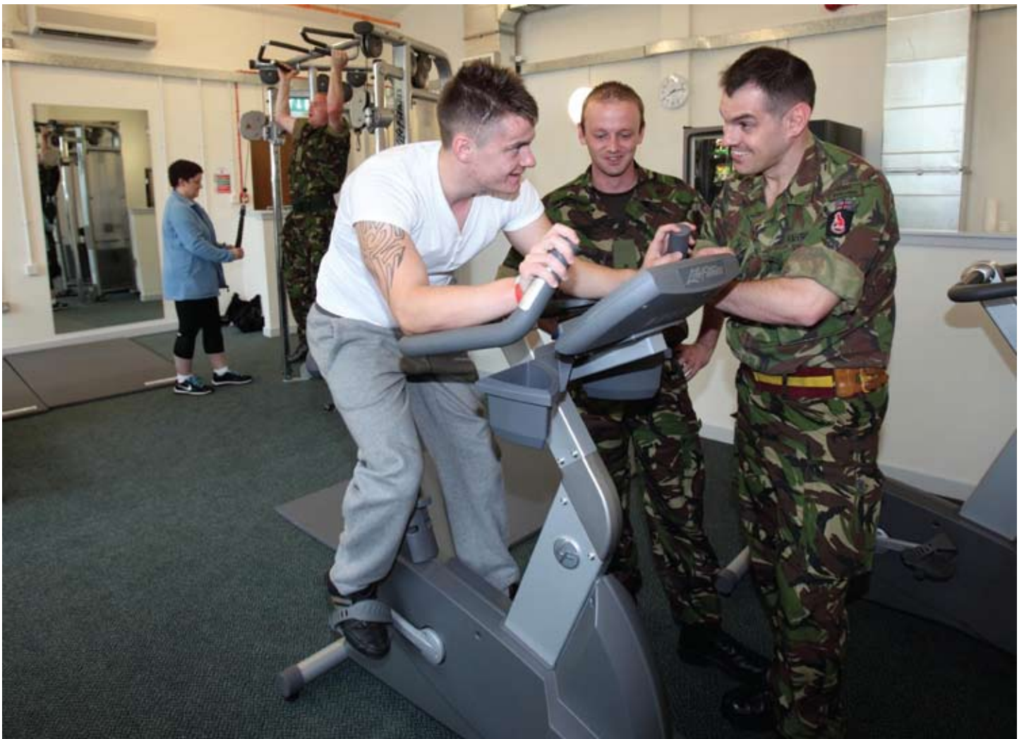
Army Recovery Centre: "Just resting – honest, Sarge!"

Our Internet site - www.veteransfirstpoint.org.uk provides a wide range of advice on all the services that veterans may require. Alternatively, contact the office on 0131 220 9920 for further information.